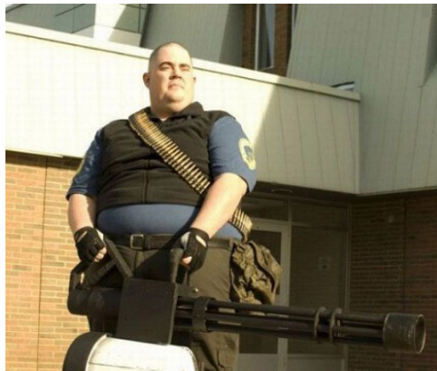
WHO TOUCHED SASHA. I KEEL YOUU.

"I have been playing Grand Theft Auto 4 for years now," one anonymous GTP victim stated, "now every day I walk to ...see Losing the game on back