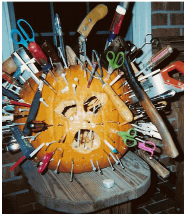
Can't you see his pain!? STOP THIS MADNESS. I hear the screams of the vegetables, their horrifying, frightened screams!

Editor's Note: And some pumpkins are made for smashing. 🍊