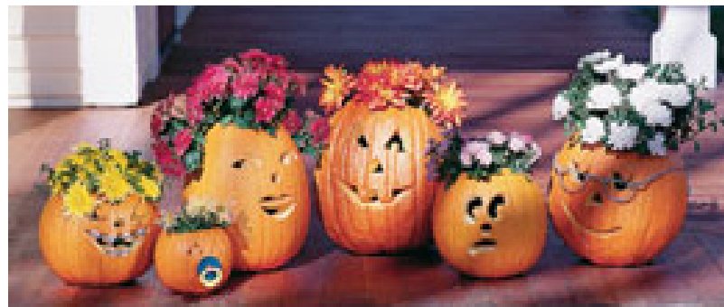
Apparently these pumpkins didn't mind being carved into and having their innards torn out. That, or the expressions of joy were CARVED INTO THEIR FACES. OH GOD! THE HORROR!