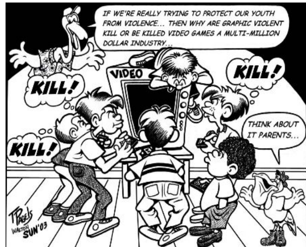
Apparently, according to this comic, TV Remotes are videogames!

of my British collages fear death will result if GTP is not treated at the beginning." The above theory of death caused by Games Transfer Phenomena is based on a case last year, where a Pokemon enthusiast got killed while single-handedly trying to thwart the plans of the Italian Mob. 🍊